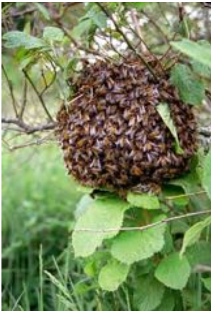
Typical examples of an Africanized Honey Bee cluster

The experts of Pestgon, Inc., are specially trained and licensed to remove Africanized Honey Bees. Pestgon provides highly qualified licensed general contractors to deal with the complexities of bee hive removal or any subsequent building repair.