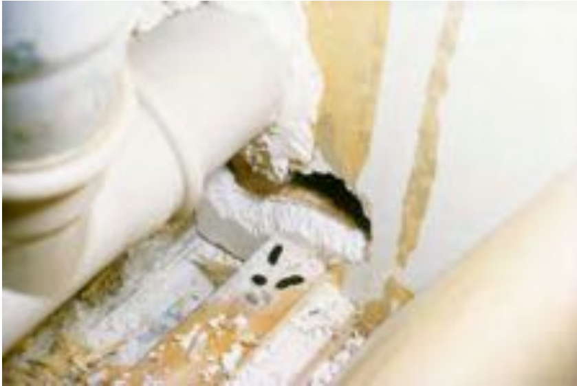
Rats activity clearly indicated by grease marks around rafters ( below ) and holes in walls ( above )

and exclusion are the first line of defense. Sanitation and rat-proofing are major considerations. Trapping inside and bait stations around the perimeter of the buildings, using approved rodenticides, are also part of Pestgon's overall strategy of rat prevention and elimination.